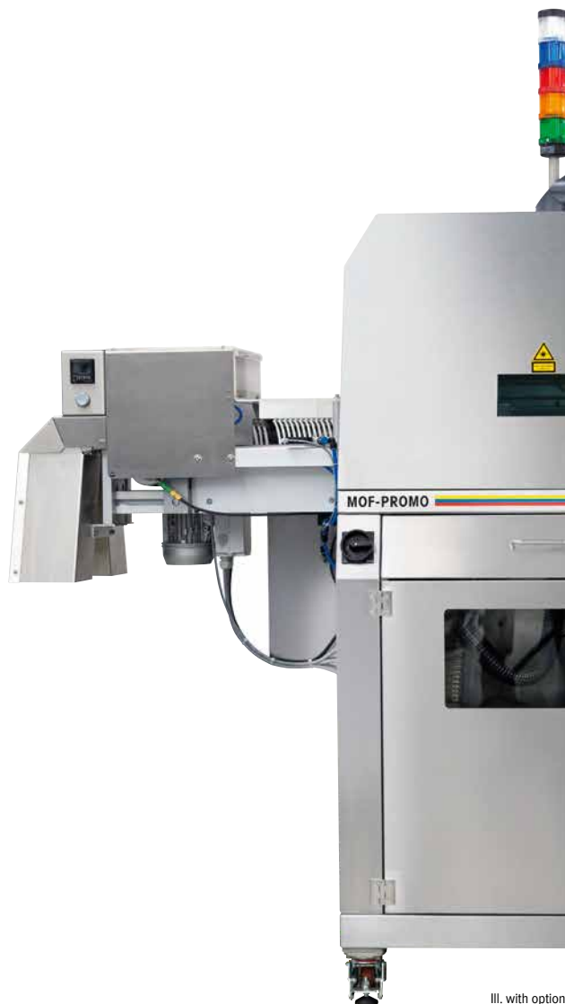
III. with options