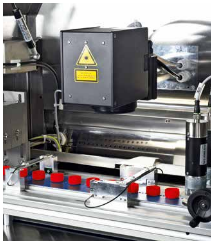
Inside view of work chamber MOF-PROMO HP