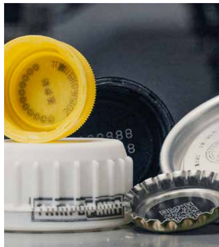
Laser marking with "Mark on the fly"