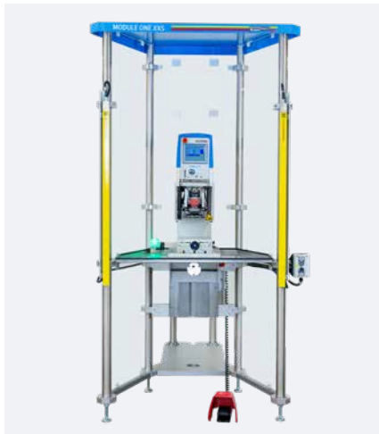
MODULE ONE XXS with pad printing machine SEALED INK CUP 90

The MODULE ONE XXS consists basically of a compact frame, a safety enclosure as well as the two standardized components: Light curtain and angle table. The pad printing machine will be individually selected from the machine series HERMETIC, SEALED INK CUP and V-DUO.