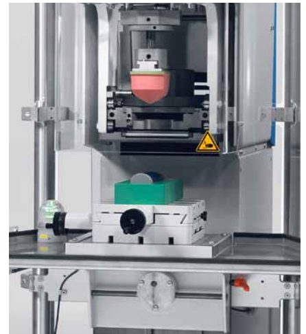
Angle table with storage shelf

A continuously height adjustable angle table allows the printing of parts with different heights .