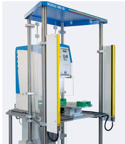
Light curtain, rotary index table, angle table

The MODULE ONE XS consists basically of a compact frame, a safety enclosure as well as the four standardized components: Rotary index table, light curtain, angle table and cross slide. The pad printing machine will be individually selected from the machine series HERMETIC, SEALED INK CUP E and V-DUO.