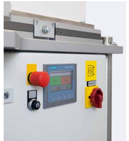
Touch panel for the operation of the index table

The height adjustable angle table with the useful storage area allows the printing of