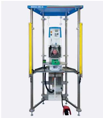
MODULE ONE XS with HERMETIC pad printing machine

The MODULE ONE XS consists basically of a compact frame, a safety enclosure as well as the four standardized components: Rotary index table, light curtain, angle table and cross slide. The pad printing machine will be individually selected from the machine series HERMETIC, SEALED INK CUP E and V-DUO.