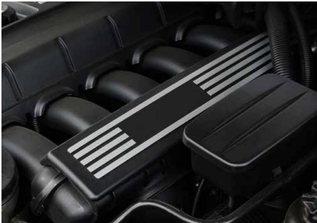
Engine cover Pad printing