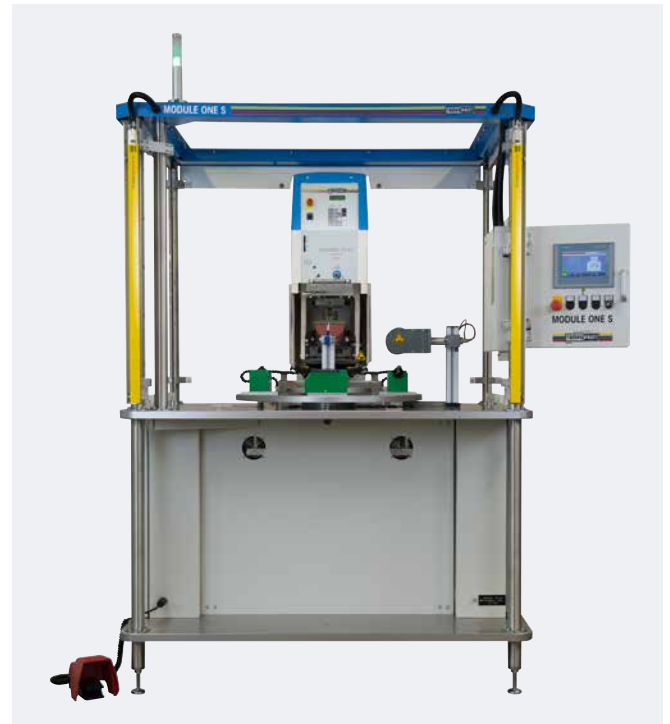
MODULE ONE S Steering column switch