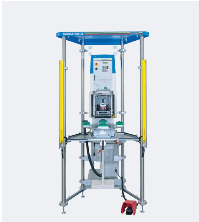
MODULE ONE XS Automotive parts

Technology, development and installation – "100% Made in Germany".