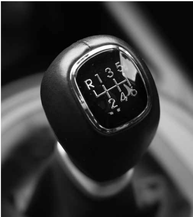
Gear shift cover Pad printing