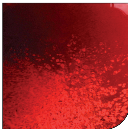
Flooding of particles with lower specific weight*

*Will not show in the printed image after homogenization/stirring