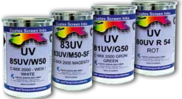
Our successful 80UV ink ranges