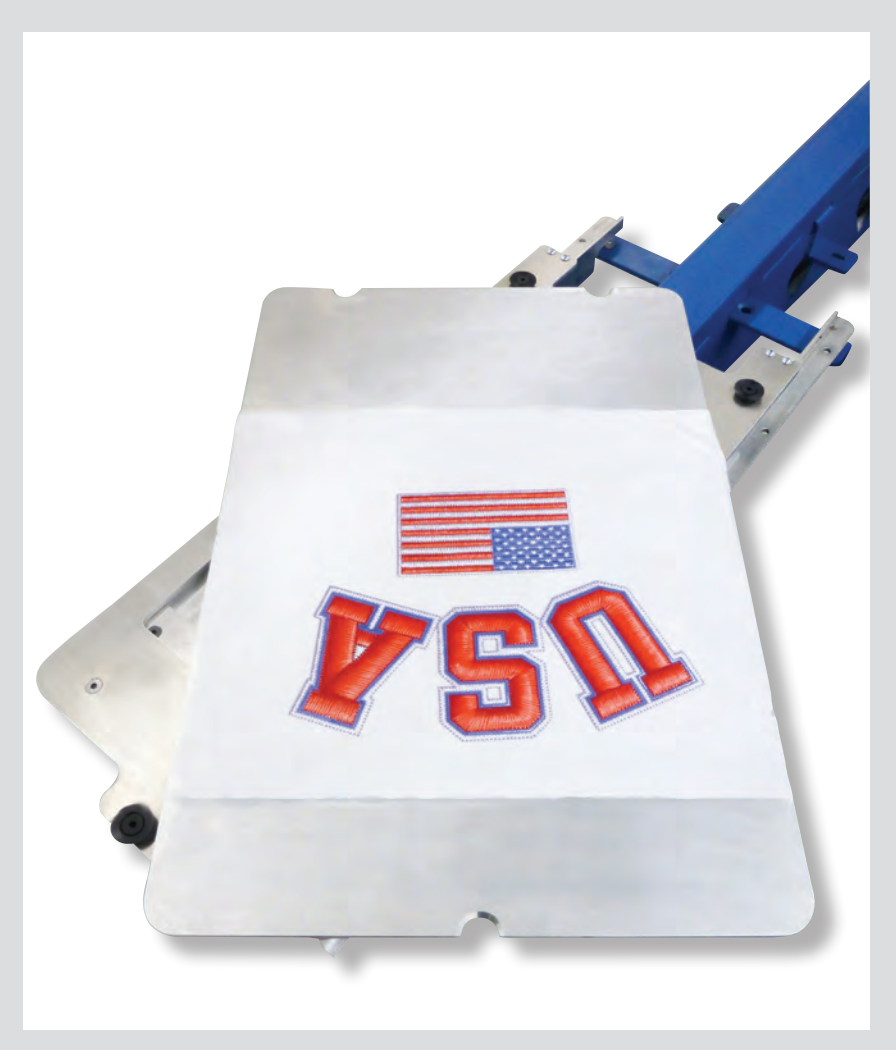
Link Pallet positioned to show part of underlying Mobile Pallet Base