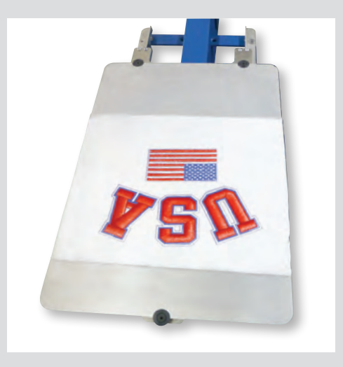
Link Pallet locked into Mobile Pallet Base and ready for printing