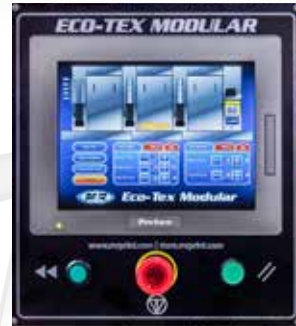
Enter Cleaning Recipe