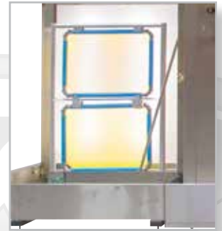
Unload Clean Screens