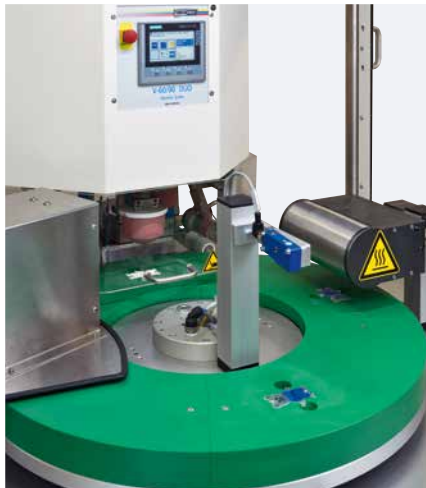
Multifunction jig surrounded by pad printing machine and components

The semi-automation MODULE ONE S is used for simple applications in pad printing. The part to be printed is manually inserted and removed.