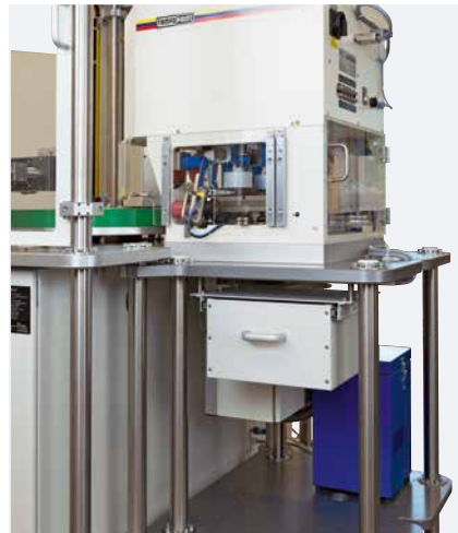
Assembly of satellite to rear side of machine with easy access to the printing units

The MODULE ONE S consists of a base frame, a rotary index table and a machine satellite. Pad printing machines from the following machine series are available for the satellite: HERMETIC, SEALED INK CUP E as well as V-DUO. Further stations can be equipped with components.