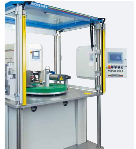
Ergonomic: User-friendly, rotating operator panel

Engineering and assembly are reduced through standardization of all auxiliary components. Solely the order-specific fixtures will be manufactured. Free choice between a standard and a vacuum-assisted jig, depending on process requirement.