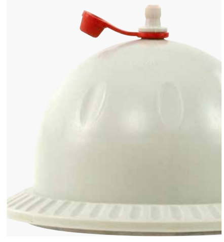
Useful closing cap