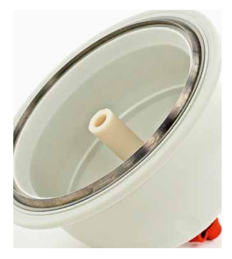
Innovative ventilation concept