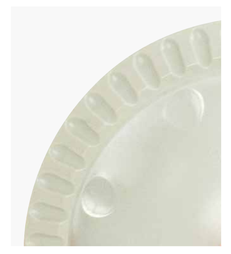
Ergonomic recessed grip

The ink/doctoring cup Ø 90 NE has a unique ventilation system which considerably reduces the increase of viscosity of the pad printing ink. That is to say: The printing characteristics of the ink remain longer preserved and this allows a stable printing process for a longer time.