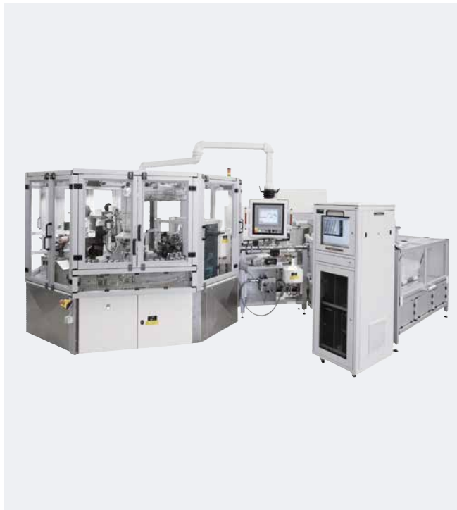
Automation Rotary pad printing Insulin pens

Machinery construction "Made in Germany", supported by highly qualified staffs in the sales department, project management, engineering department as well as pre- and after-sales service will guarantee the professional realisation from the concept to the 24 hour production to our customers.