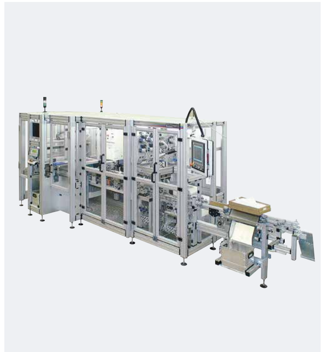
Automation for ampoule strips with RAPID 2000/130