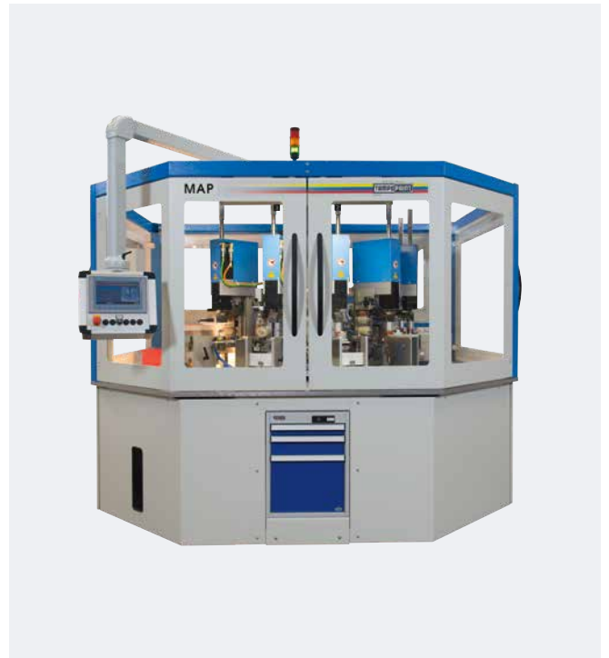
Automation MAP Ampoule strips