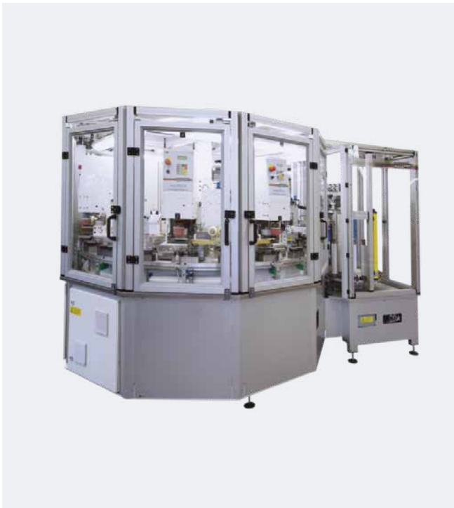
Automation for inhaler counter rings with RAPID 2000/90