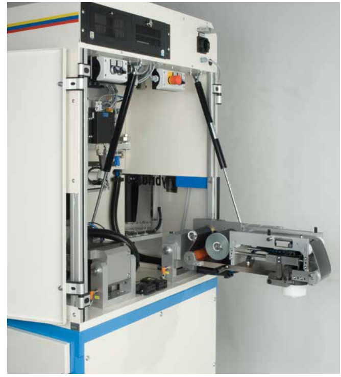
HYBRID-90-2 Slewable printing unit