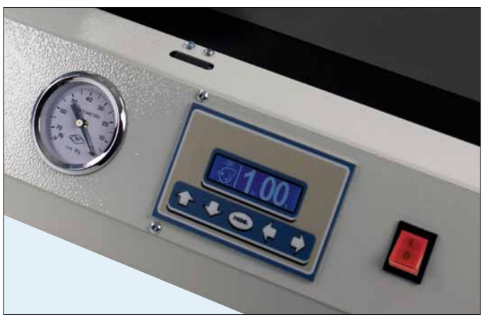
Electronic control unit for easy operation