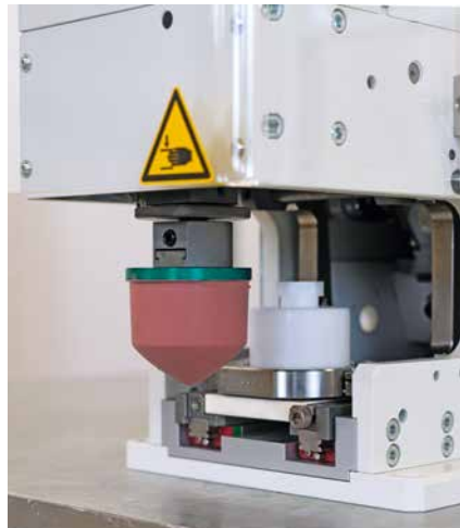
Print area RAPID 60

The machine impresses with its high speed and at the same time with its high repeat accuracy. Thanks to its smooth running, it provides for a stable and continuous printing process. The