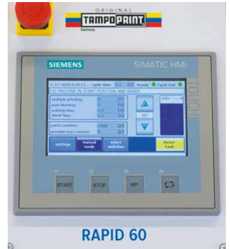
State-of-the-art operation via user-friendly touch display

The RAPID series is available with useful, practical and additional extensions for individual configurations. The optional ink residue pick-up system is recommended for consistent print quality. For the integration into automation