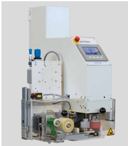
RAPID 60 built-in with optional ink residue pick-up system

The machines of the RAPID series are used for integration in fully automated processes in various industrial sectors, such as automotive, toys, medical technology and many more. They focus on product markings and decorations, which are produced in high quantities and at high process speed.